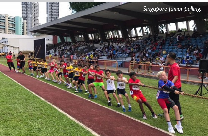
Singapore Junior pulling.