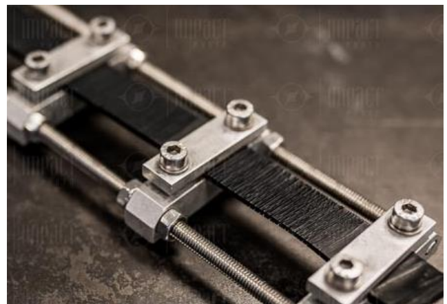
The effect of the exposure to ozone

At first glance, fine cracks in the surface rubber may not seem to be a major problem but over a period the rubber becomes increasingly brittle. Transversal cracks deepen under the repeated stress of passing over the pulleys and drums and, if the conveyor has a relatively short transition distance, longitudinal cracks can also begin to appear.