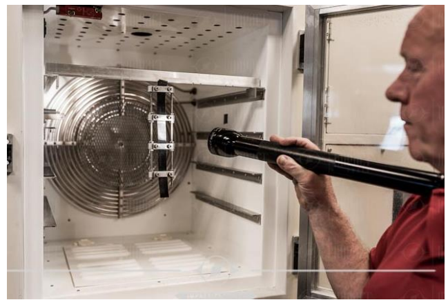
Testing at Dunlop lab

Belts that do not operate under shelter are especially prone to surface cracking, which can be extremely detrimental in terms of the performance of the belt and its working life. Even more significant are the environmental and health and safety consequences of the damage caused by ozone exposure because dust particles from the materials being conveyed penetrate the surface cracks and are then discharged (shaken out) on the return (underside) run of the belt.