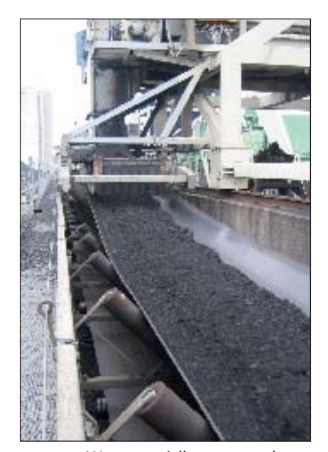
Fig. 3: Wear especially occurs at the loading point where the belt is exposed to impact.

The actual thickness of the cover is an important consideration. In principle, the difference in thickness between the top