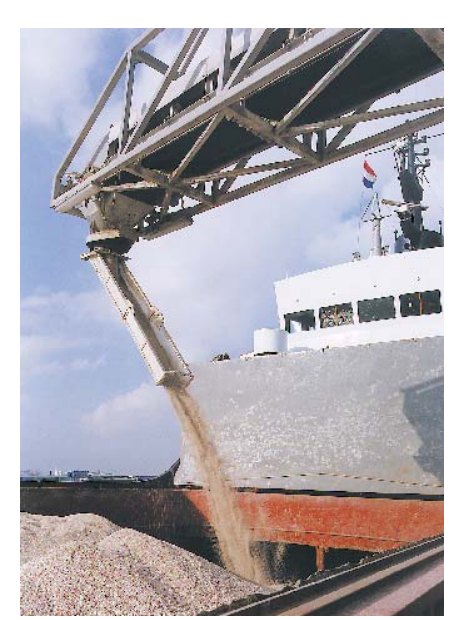
Fig. 5: Some bulk materials can have a surprisingly high level of oil.

In terms of resistance to wear, Dunlop's approach has been to provide a longer lasting and therefore more cost-effective solution by developing covers that significantly exceed international quality standards. An excellent example of this is their