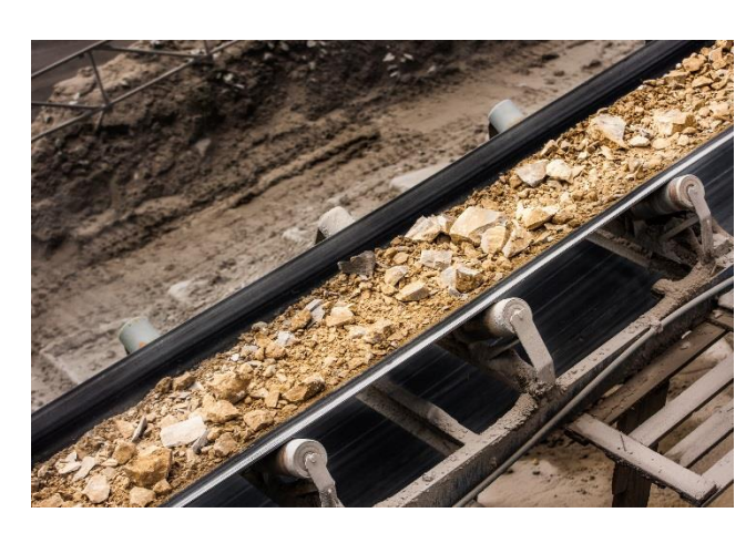
Exposure to ozone may decrease the tensile strength of the rubber, which is crucial some industries.