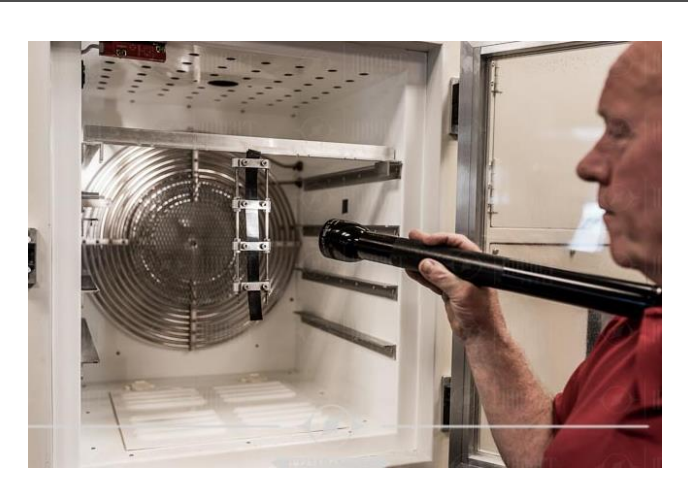
Testing at Dunlop lab

Belts that do not operate under shelter are especially prone to surface cracking, which can be extremely detrimental in terms of the performance of the belt and its working life. Even more significant are the environmental and health and safety consequences of the damage caused by ozone exposure because dust particles from the materials being conveyed penetrate the surface cracks and are then discharged (shaken out) on the return (underside) run of the belt.