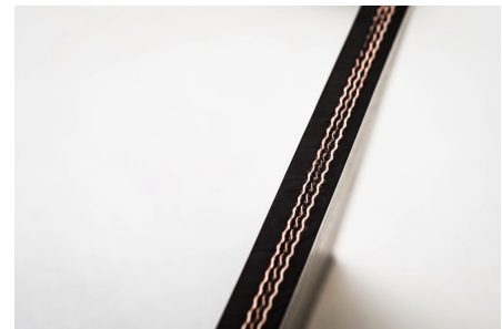
Unsealed (raw) cut belt edge

Apart from a better visual aspect, having a sealed edge means that moisture is prevented from being drawn into the carcass from the edge by capillary forces. Although the synthetic carcass fibres are hardly affected, moisture can ultimately cause vulcanising problems when making splice joints so it is better to be safe than sorry. Having a sealed edge enables a belt to be safely used in wet conditions and makes it better suited to long term storage outdoors.