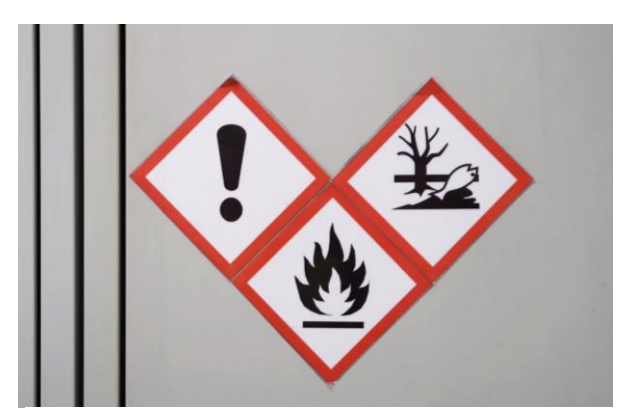
Are manufacturers complying with REACH regulations?

The influence of raw material costs on the selling price is highly significant. Although there can never be a fixed formula due to the wide variety of individual belt specifications, a general 'rule of thumb' is that raw materials represent some to 75% of the cost of producing a conveyor belt. Thanks to the high level of automation, the labour cost element is very low. Masks prevent inhalation of dust particles. When faced with a price that looks "too good to refuse", it is therefore perfectly reasonable to conclude that raw materials of questionable quality have been used. The pressure to keep costs to an absolute minimum has increasingly led to the use of sub-standard raw materials and recycled rubber that can often be of very dubious origin. Within recycled rubber there is, almost inevitably, a higher risk that potentially harmful chemical substances are present.