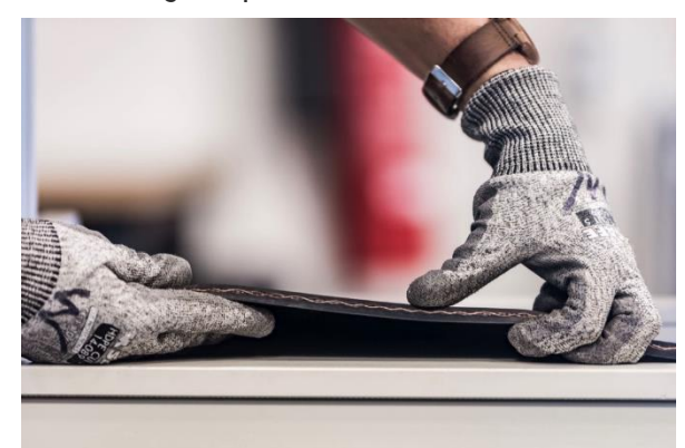
Always wear gloves when working with rubber belt

REACH applies to all European-based manufacturers and all products sold and used within the EU. Manufacturers established outside of the EU are not bound by the obligations of REACH, even if they export their products into the customs territory of the European Union. They are therefore free to use unregulated raw materials and chemicals that may be prohibited or have usage limitations within the European community. Very importantly, as the EU destined product itself is not exempt from REACH, it is therefore the importers of products manufactured outside of the EU who are responsible for fulfilling the requirements of REACH rather than the original manufacturers.