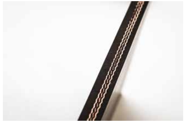
Unsealed (raw) cut belt edge

Apart from a better visual aspect, having a sealed edge means that moisture is prevented from being drawn into the carcass from the edge by capillary forces. Although the synthetic carcass fibres are hardly affected, moisture can