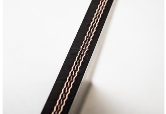
Cut edge of multi-ply belt

Belts with cut edges are produced in the same way as described previously but are cut (slit) using conventional rotating knives. A 'cut edge' is therefore not sealed. At Dunlop we do not recommend the use of unsealed (raw) cut belt edges as wet conditions and outdoor storage conditions can cause water to enter the carcass from the edge due to capillary forces. Although the carcass fibres are hardly affected, moisture can cause vulcanising problems when making splice joints.