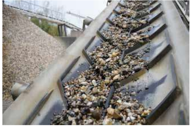
Chevron belts with a single homogenous structure are stronger and longer-lasting by far.

Bearing in mind the technical complexity and the higher costs involved, perhaps it is not surprising that apart from Dunlop Conveyor Belting, hardly any other manufacturer of note produces profiled chevron belt in this way. However,