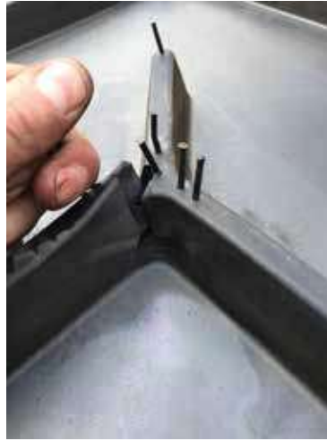
Splitting the difference in price and quality.

the same would seem to be a reasonable assumption. However, the alarm bells should start to ring if there is a significant difference in the asking price. Actually, there is a very good reason why one belt can have a dramatically lower price compared to one of a seemingly identical specification, and that reason is very easy to explain. Ultimately, the difference in price will come down to the quality of the rubber, and it is the quality of the rubber that will have the biggest bearing on performance and the cost-effectiveness of the end product.