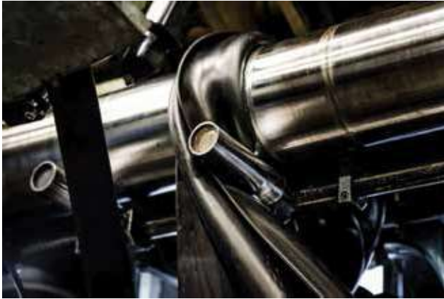
A 'single structure' chevron belt needs a highly specialised rubber.

needs to be fully resistant to the effects of ozone and ultra violet light (for longevity of working life) and conform to European REACH regulations so that the end product is also safe to handle.