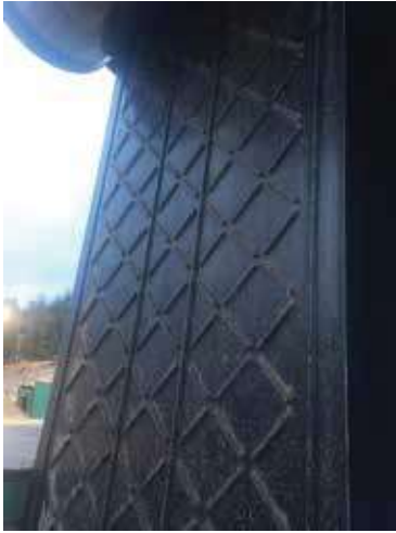
Still going strong – a five-year old Dunlop Multiprofit belt in action.