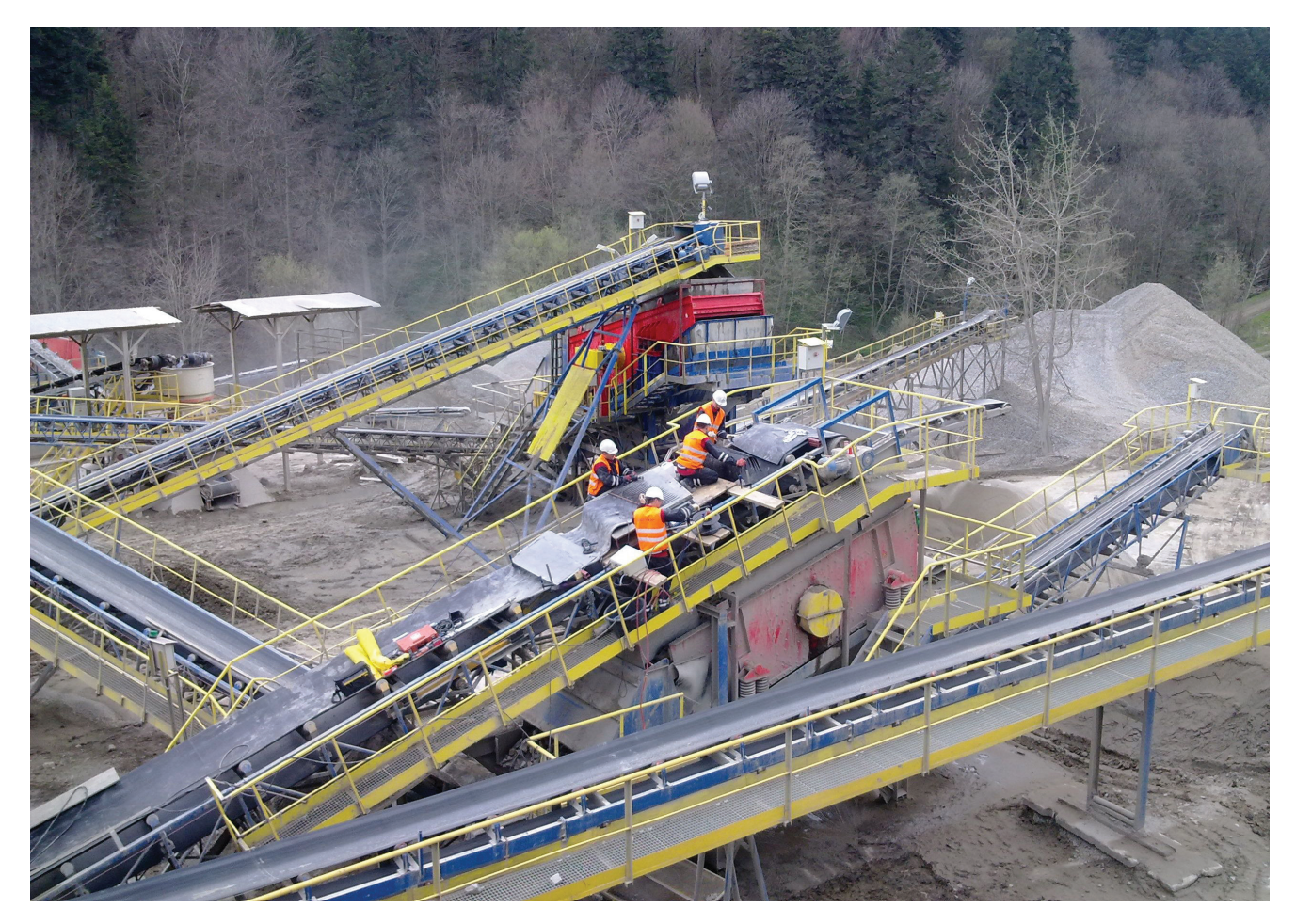
The cost of making the splice is a small fraction of the cost of a system shutdown.