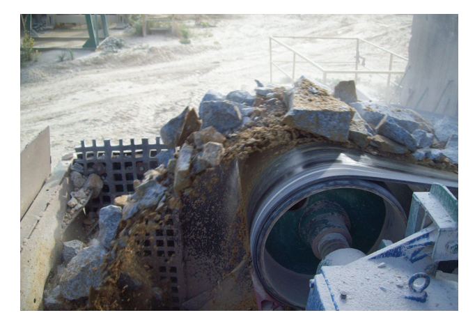
Finger splicing allows super-tough belts such as Ultra X to be used on demanding applications.

important consideration because it can significantly lower both direct (actual repair) and indirect (lost output) costs.