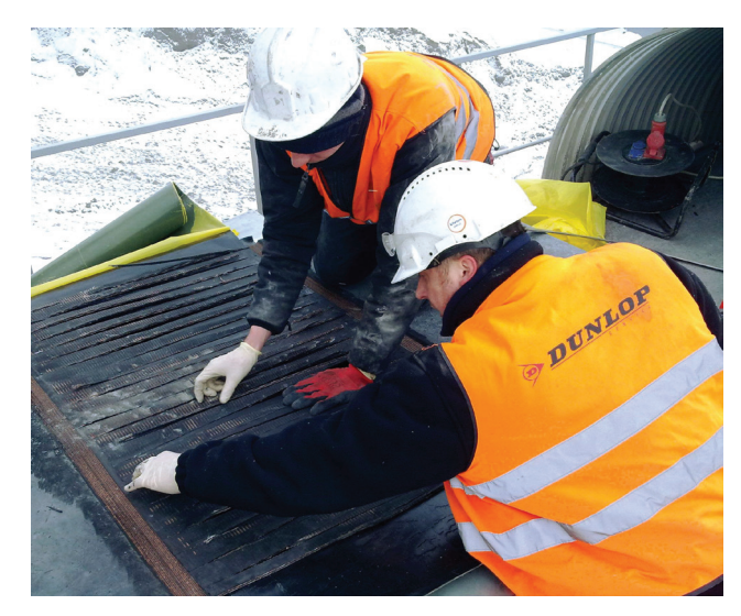
Using a finger splice can mean that a lower and less costly spec belt can be used.