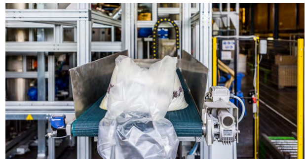
Precise measurements of each ingredient in biodegradable bags are mixed and blended together

There are literally hundreds of different chemicals and ingredients used to make the huge variety of different rubber compounds that different conveyor applications demand. Perhaps the best analogy to use is that it is like making cakes that have to taste precisely the same every time . The mixing process is where all of the polymers, chemical additives, carbon black and zinc oxide are mixed together according to the specific recipe for the required rubber type. For accuracy and consistency, at Dunlop we use a highly advanced computerised, automated mixing carousel that places very precise measurements of each ingredient into biodegradable bags. These ingredients will be used to ultimately create a batch of compound weighing between 200-250kg.