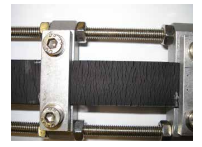
Ground level ozone seriously damages rubber

As a direct result, special anti-oxidant additives that act as highly efficient anti-ozonants and protect against the damaging effects of ozone and ultra violet became an essential ingredient in all Dunlop rubber compound recipes without exception. Unfortunately, for their customers, hardly any other belt manufacturers make use of these anti-oxidant additives. I will explain the reason for this shortly.