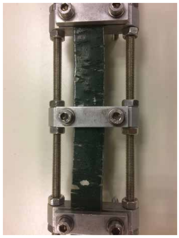
Some rubber literally disintegrates.

but even in the most moderate of environments, the problem is ever-present and, as with ozone, it would be foolish to underestimate the damage it causes.