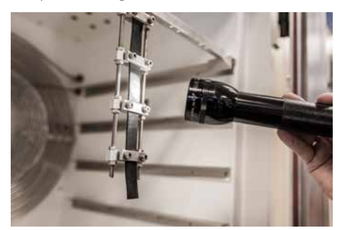
Samples are checked for cracking at two-hourly intervals.