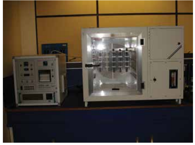
Dunlop's ozone testing cabinet.