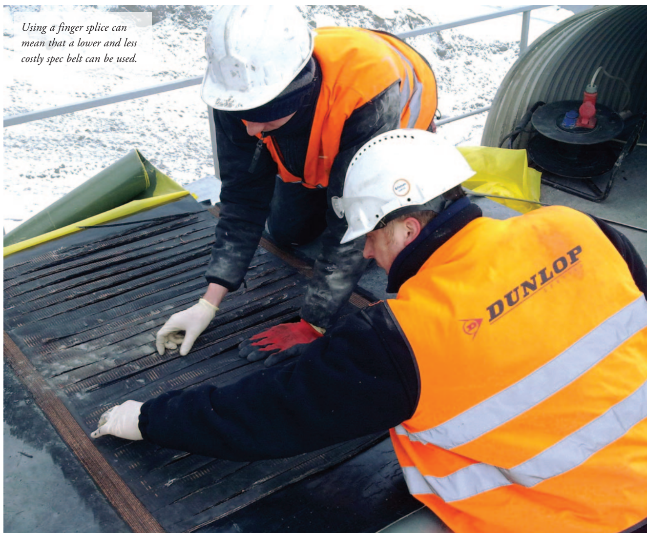
Using a finger splice can mean that a lower and less costly spec belt can be used.