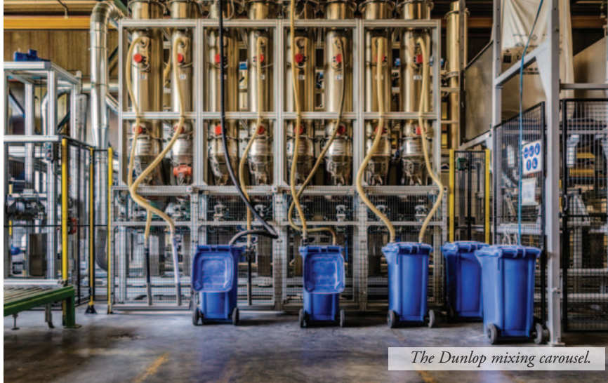
The Dunlop mixing carousel.

start the mixing process as separate batches of ingredients. For example, Batch A may contain 90% of all the ingredients and Batch B may contain the remaining 10% that need to be mixed under slightly different conditions. When cooking a meal a chef would not throw all the ingredients into one pot and cook them for the same length of time at the same temperature and that same principle applies to making a complex rubber compound. After the initial mixing, the two batches are then mixed together to form the final batch. In all cases, regardless of rubber type, not only does the rubber compound have to possess all of the requisite physical properties and characteristics, it must also be able to undergo the further processes involved in making a conveyor belt, such as calendaring for example.