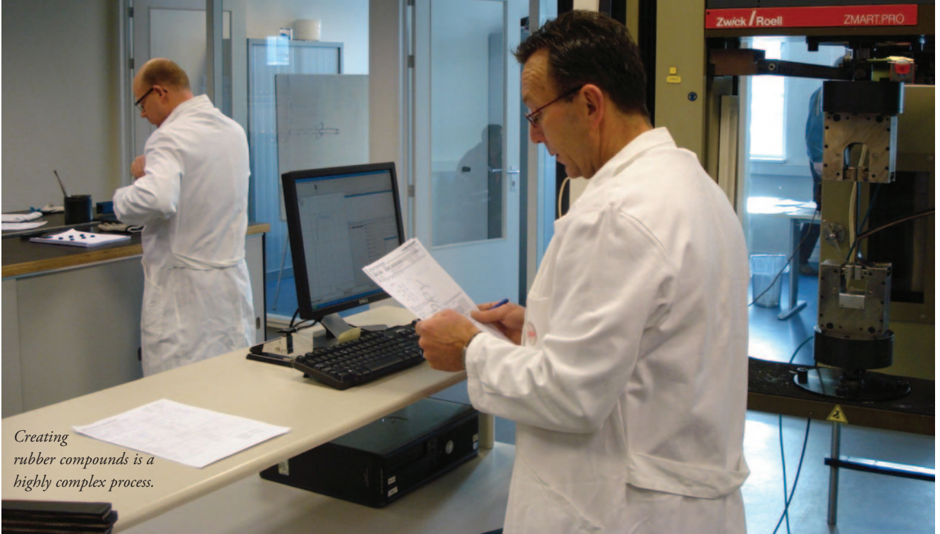
Creating rubber compounds is a highly complex process.

according to a very specific recipe. These always include the basic ability to resist abrasive wear, otherwise the surfaces will wear down too rapidly. The rubber will also need to meet specific minimum requirements in terms of tensile strength, elongation (stretch), hardness (Shore), and resistance against tearing (tear strength). The list does not end there because every type of rubber cover also has to be able to endure potentially sub-zero temperatures (usually at least minus 20 or 30°C) and, at the other end of the scale, withstand maximum continuous material tempera-