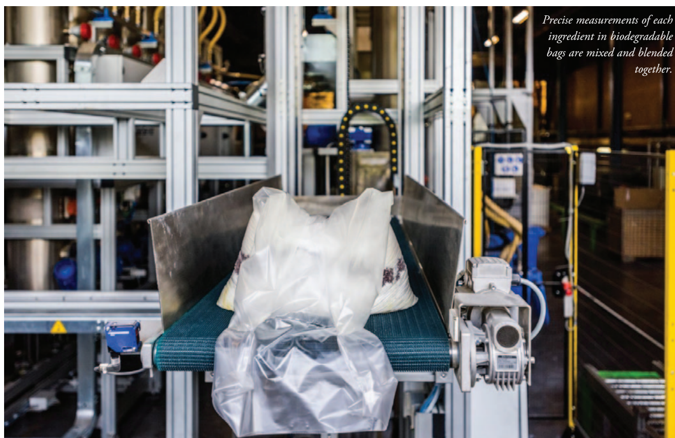
Precise measurements of each ingredient in biodegradable bags are mixed and blended together.

As I have already mentioned, there are literally hundreds of different components that are used to create the various rubber compounds, such as anti-degradants, anti-ozonants and also as accelerators (essential for the vulcanization process for example). These components include primary amine-based sulfenamides, such as N-cyclohexyl-2-benzothiazole sulfenamide, and thiazoles,