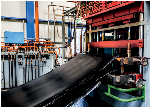
Cost-cutting target – Rubber represents 70% of the volume and 50% of the cost.