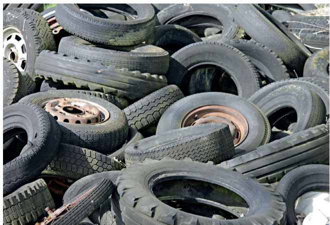
Cheap, low-grade carbon black is created by burning scrap tyres.