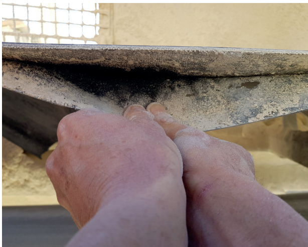
Delamination – the layers of the belt detach themselves.

The fact is that, certainly in the case of conveyor belts, the very high level of automation nowadays means that labour costs do not make a significant difference to the ultimate selling price. As a rule, the labour element represents around 5% of the total cost whereas the materials used to make a conveyor belt constitute some 75% of the ultimate cost.