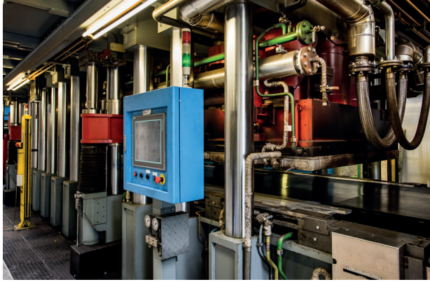
Conveyor belt production is highly automated.

In reality, there are numerous reasons why some suppliers are able to dramatically undercut their competitors. However, before explaining those reasons it is important to first deal with one of the most common misconceptions of all, which is that products imported from Asia are of a similar quality but simply cost less because labour costs are much lower.