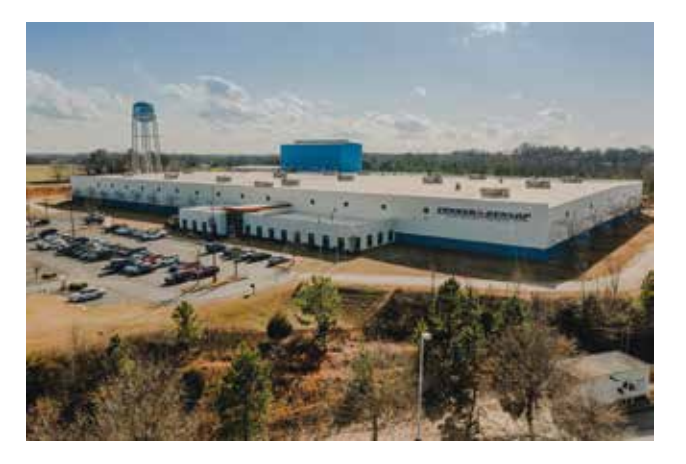
Home advantage - Fenner Dunlop's in-house fabric weaving facility in the USA

The big advantage that the Dunlop engineers had was having an in-house fabric weaving facility located in the USA where new thinking could be explored. It was thanks to their creation of an amazingly tough patented woven fabric that enabled the engineers to design a unique, super-strength 'breaker weft construction' single-ply belt.