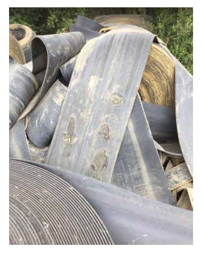
The use of imported 'sacrificial' belts is a never-ending 'fit, repair, replace' cycle.

For developmental work to be effective, it is important to have clear ambitions and objectives. Not having a destination in mind makes it impossible to even know what general direction to take. Fortunately, Dunlop's research & development teams on both sides of the Atlantic benefitted from having a very clear shopping list – superior durability,