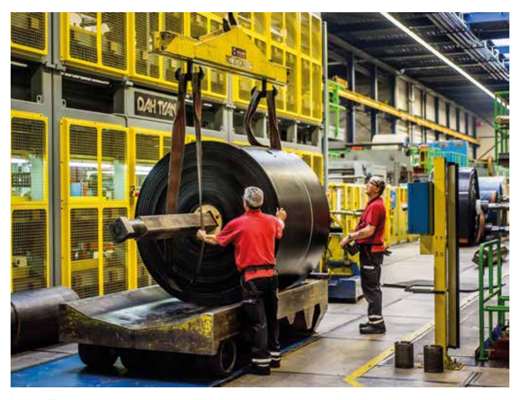
More efficient production processes consume less energy.

completely and the whole noise level of the conveyor dropped by at least 50%. The quarry also discovered that with Ultra X they only needed a single 37kw drum instead of the double drum drives they had to use with conventional multi-ply belts.