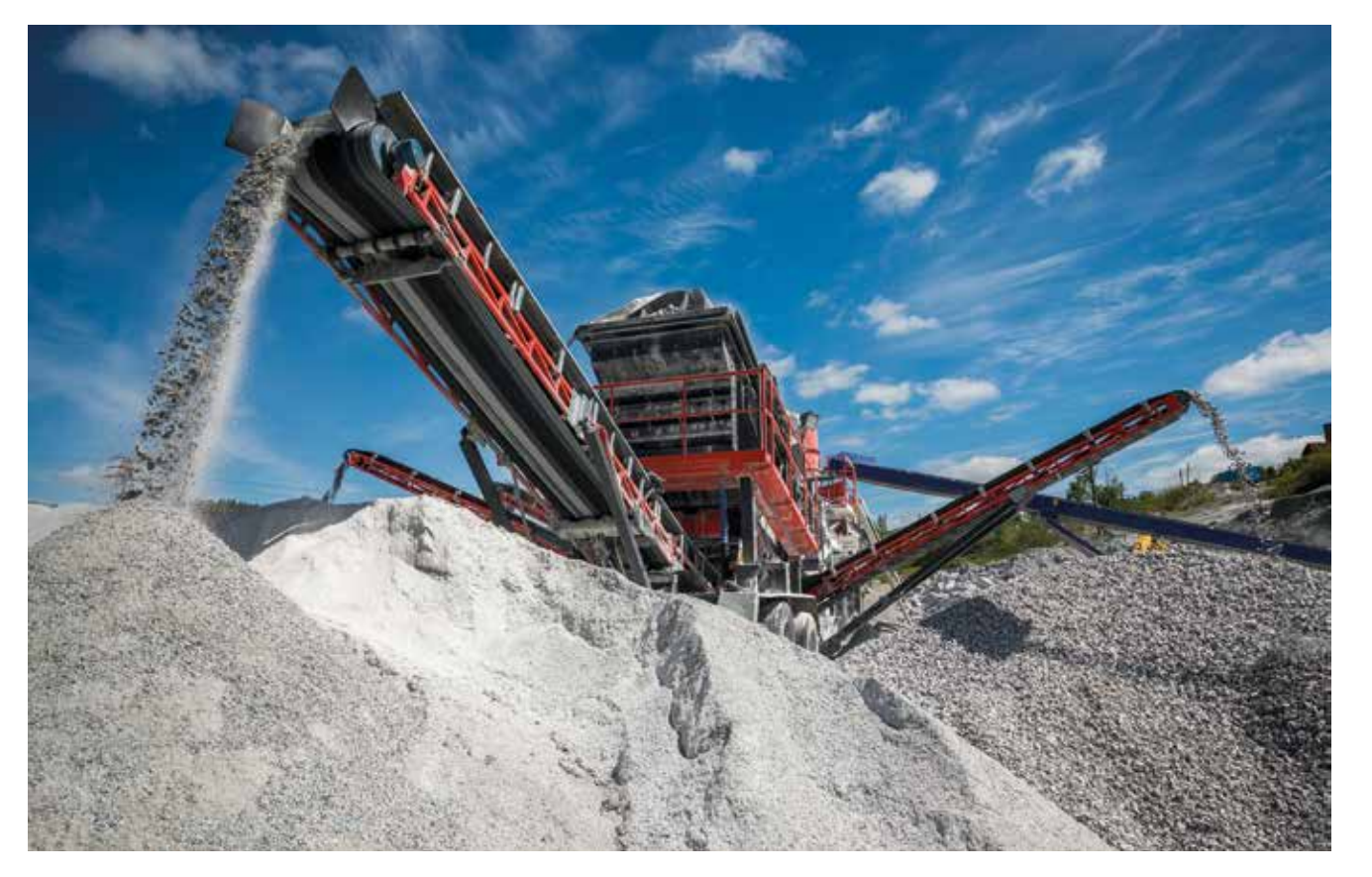
Ideally suited to run on mobile machinery despite small pulley diameters.

Since the introduction of Ultra X to the market some three years ago, some unexpected advantages have also emerged. One UK quarry, for example, found that the multi-ply belts used previously made the head drum squeal constantly and the rollers emit a constant, loud rumble. Located on the border of a wildlife sanctuary, it was therefore a very welcome surprise when the first Ultra X conveyor belts were fitted because the squealing stopped