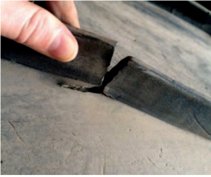
The bad: constant flexing can cause dynamic stress fractures in conventionally produced chevron belts.

contact point where the two different rubber compounds join instantly becomes a point of weakness because, as explained earlier, the chevron profiles constantly stretch and flex under significant tension each time they run around a pulley or drum. This means that unless the bond between the base belt carcass and the chevron profile is absolutely flawless then sooner or later dynamic stress fractures in the profile will begin to occur, eventually causing the profile to split and all too often completely part company with the rest of the belt.