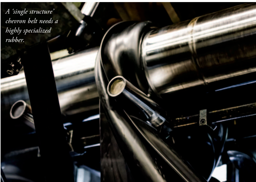
A 'single structure' chevron belt needs a highly specialized rubber.

Although easier and cheaper to achieve, the biggest disadvantages of the two-step production process, is that two non-