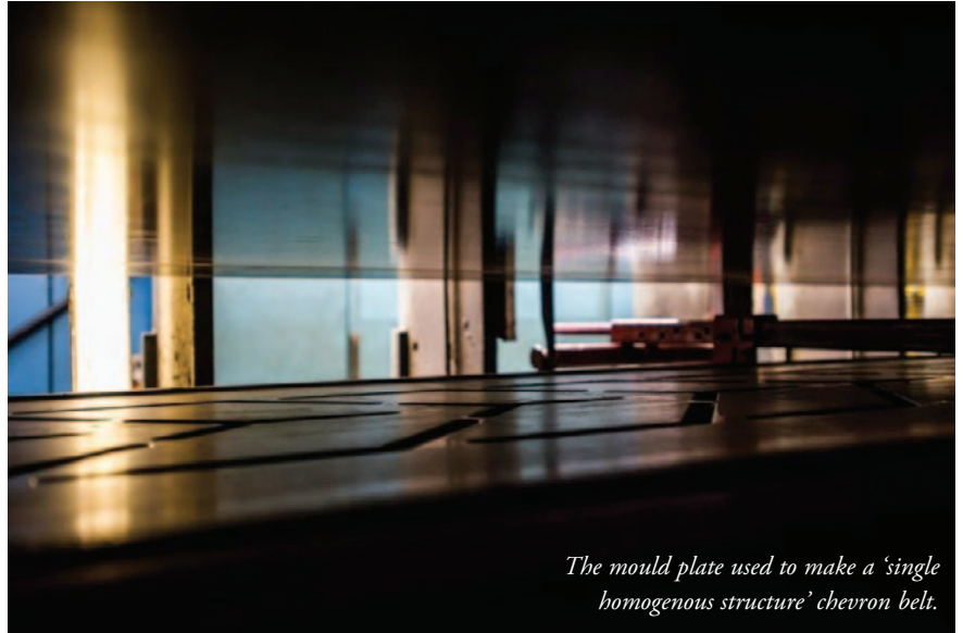
The mould plate used to make a 'single homogenous structure' chevron belt.

This problem is significantly magnified on mobile conveyor equipment with relatively small pulley diameters. The smaller the pulley then the higher the dynamic stress. Failure will happen even sooner if, as I touched on earlier, one (or both) of the rubber compounds are not fully resistant (as per ISO 1431 testing) to the effects of degradation (surface cracking) created by chemical reactions in the rubber caused by ground level ozone and ultraviolet light. Sad to say, as a consequence of the relentless pursuit of low prices, the vast majority of