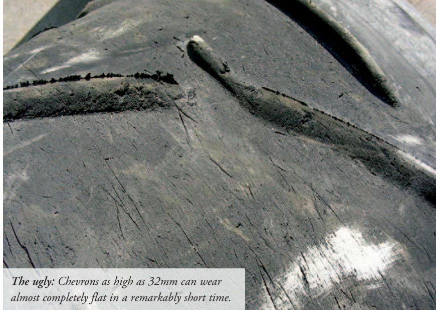
The ugly: Chevrons as high as 32mm can wear almost completely flat in a remarkably short time.

identical rubber compounds are vulcanized (bonded) together. One compound formula is used to create the base belt and a different, more malleable compound is used in the mould plates. The first big disadvantage is that the bond between the different compounds is naturally weaker and more prone to the effects of dynamic stress. The second big disadvantage is that the more pliable compound used for the mould plates invariably has a much lower resistance to cutting and abrasion.