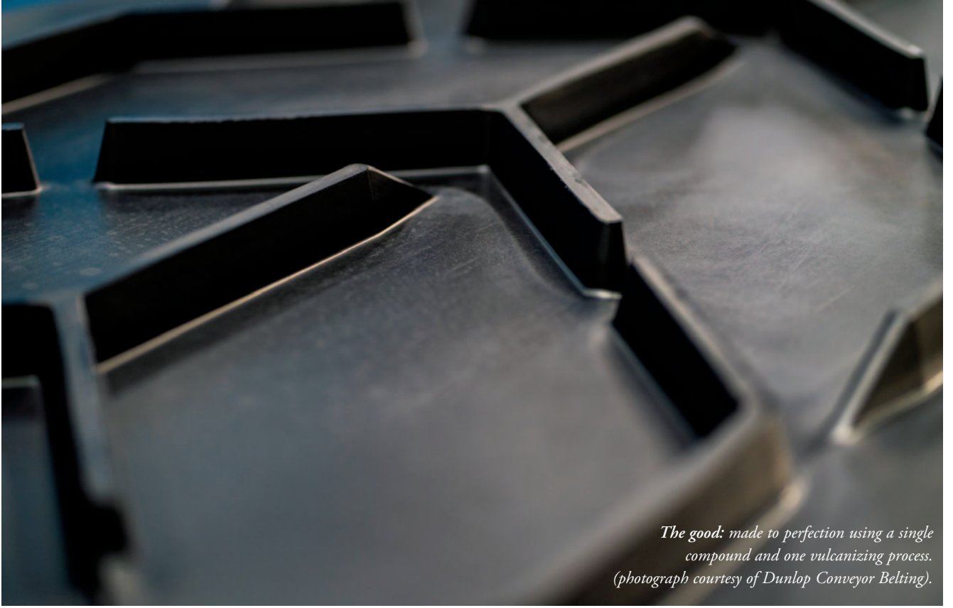
The good: made to perfection using a single compound and one vulcanizing process.

is when there is a significant difference in the asking price.