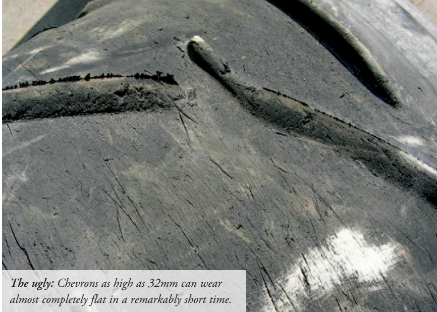
The ugly: Chevrons as high as 32mm can wear almost completely flat in a remarkably short time.

identical rubber compounds are vulcanized (bonded) together. One compound formula is used to create the base belt and a different, more malleable compound is used in the mould plates. The first big disadvantage is that the bond between the different compounds is naturally weaker and more prone to the effects of dynamic stress. The second big disadvantage is that the more pliable compound used for the mould plates invariably has a much lower resistance to cutting and abrasion.