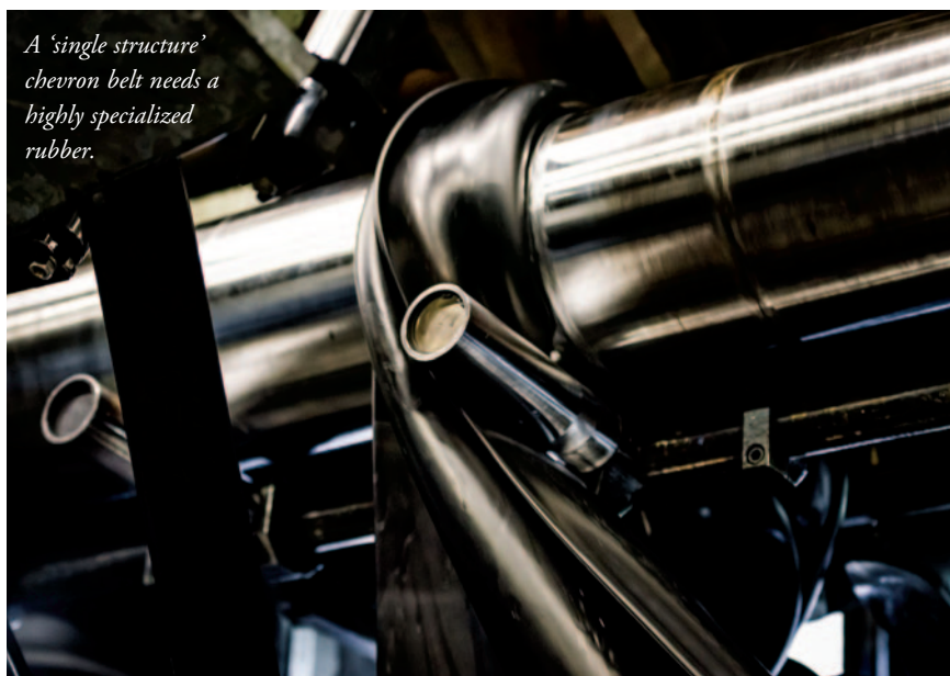
A 'single structure' chevron belt needs a highly specialized rubber.

Although easier and cheaper to achieve, the biggest disadvantages of the two-step production process, is that two non-