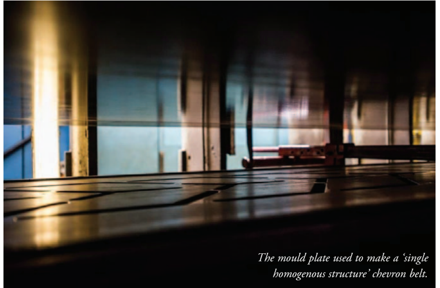
The mould plate used to make a 'single homogenous structure' chevron belt.

This problem is significantly magnified on mobile conveyor equipment with relatively small pulley diameters. The smaller the pulley then the higher the dynamic stress. Failure will happen even sooner if, as I touched on earlier, one (or both) of the rubber compounds are not fully resistant (as per ISO 1431 testing) to the effects of degradation (surface cracking) created by chemical reactions in the rubber caused by ground level ozone and ultraviolet light. Sad to say, as a consequence of the relentless pursuit of low prices, the vast majority of