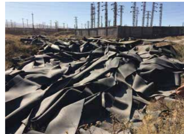
Non-European manufacturers are free to use unregulated raw materials including those that contain Persistent Organic Pollutants (POPs).