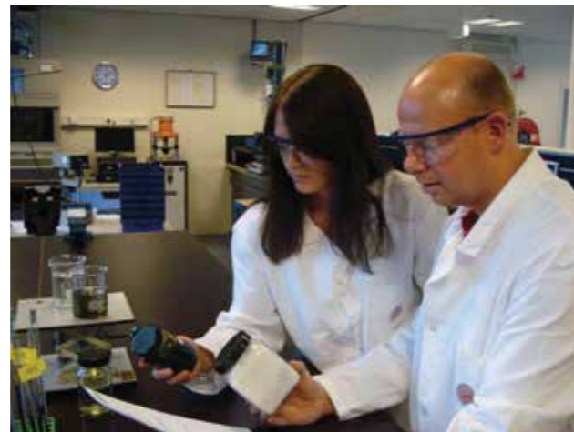
SVHC – Substances of very high concern.

REACH was established by members of the EU with the specific aim to improve the protection of human health and the environment through the better and earlier identification of the properties of chemical