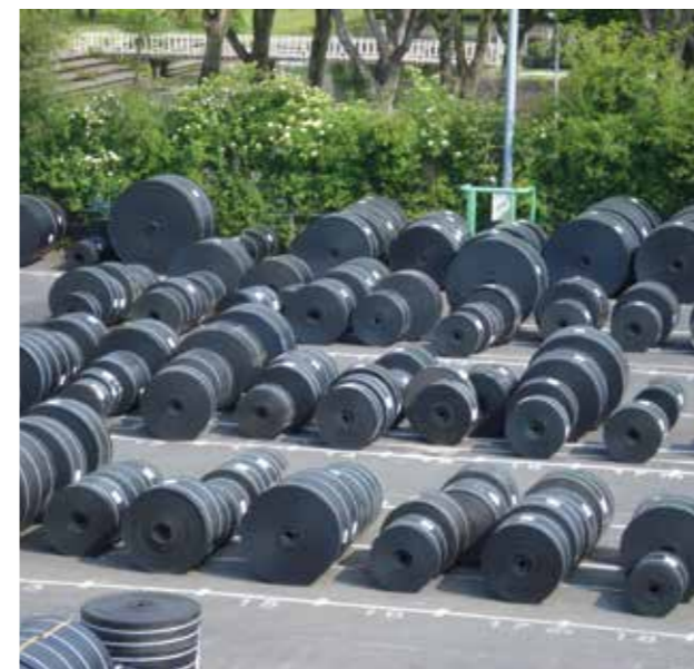
Less than 10% of rubber belts are recycled

To fully appreciate why the length of the life cycle of rubber conveyor belts is so important it is first necessary to understand the background. Rubber constitutes at least 70% of the material mass of both multi-ply and steelcord