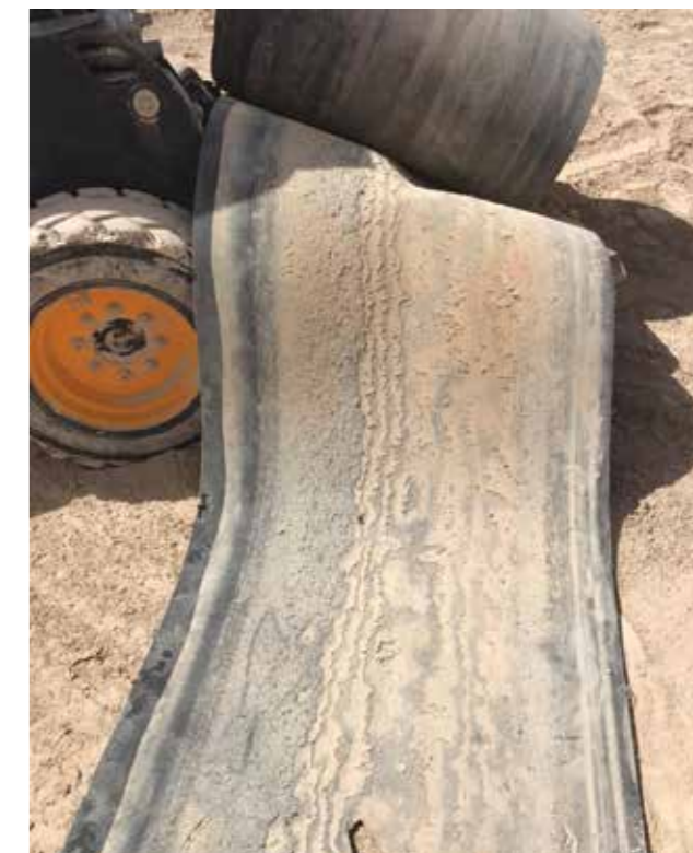
The amount of conveyor belting we use and discard represents the biggest influence on the industry's carbon footprint.

No matter how much we would like it to be different, the harsh reality is that under foreseeable market circumstances, recycling industrial conveyors is not only ecologically problematic, but also not viable. This is precisely the reason why producing and using conveyor belts