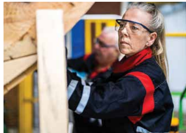
Every industry, company and individual have a part to play.

There has been enormous media interest surrounding the United Nations COP 26 meeting held in the UK this year. Hopefully, it is a sign that most world leaders are at long last starting to take the threats posed by climate change to the future of our planet and our way of life seriously. However, such is the scale of the problem that a concerted