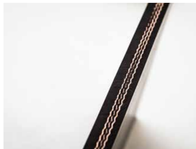
The combined weight of SVHC should not exceed 0.1% of the actual product weight.

Because we manufacture our own rubber and make every belt ourselves makes it easier for us to comply with these stipulations compared to most other belt manufacturers because we have full control over everything that we do.