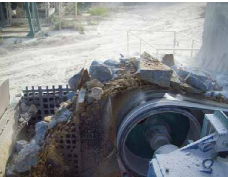
The way forward – single ply belts that are superior to traditional multi-ply in every respect.

In Dunlop we sincerely believe that the development of a single ply conveyor belt that not only significantly outperforms its thicker, heavier, multi-ply counterparts but also have dramatically less impact in terms of its carbon footprint is a genuine and very exciting game changer.