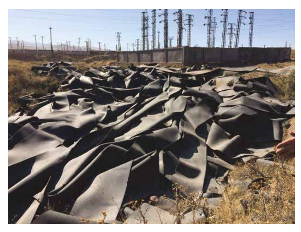
The amount of conveyor belting being used and discarded represents the biggest influence on the industry's carbon footprint.

BN: What is the second part of the answer?