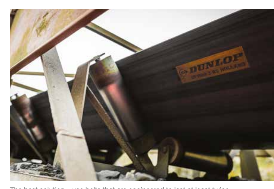
The best solution – use belts that are engineered to last at least twice as long as low-price 'throwaway' belts.