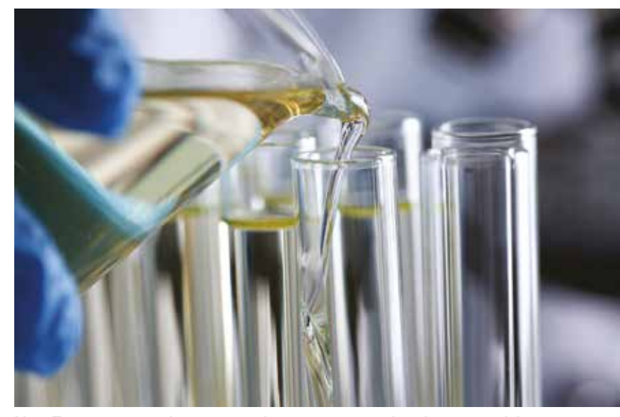
Non-European manufacturers are free to use unregulated raw materials including those that contain Persistent Organic Pollutants (POPs).

KdH: The actual production process has not changed fundamentally for a great many years