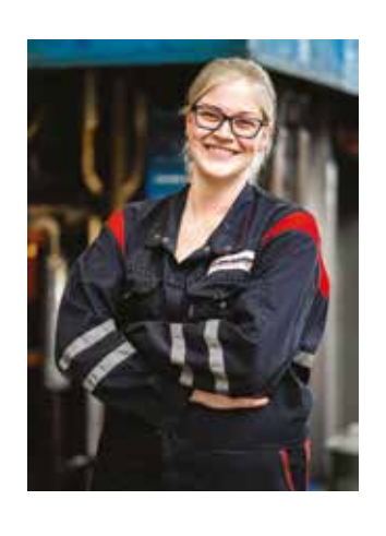
No barriers. In Dunlop, women fulfill a wide range of seriously important roles.

important roles. Times are changing so much and it is great to see.