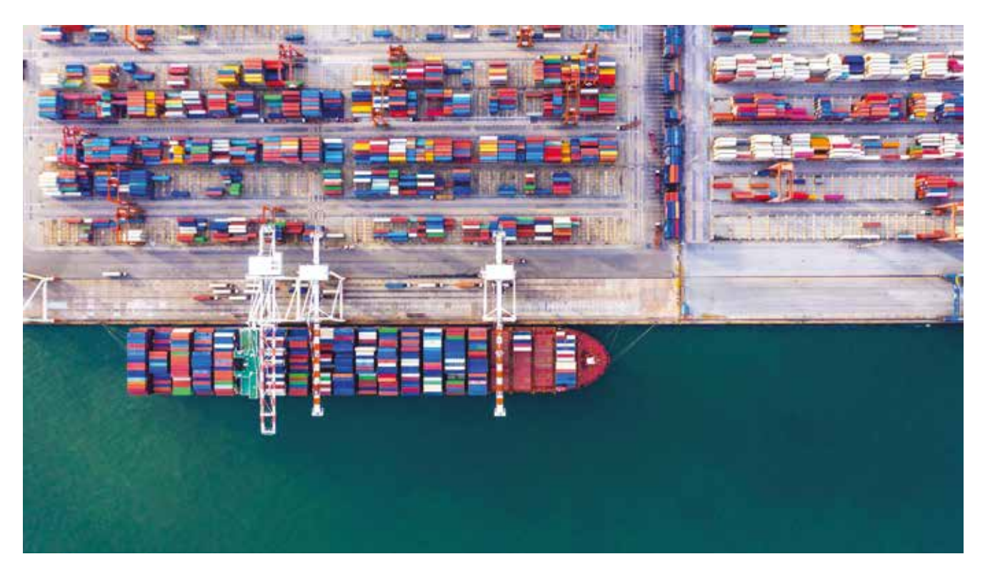
The after-effects of Covid 19 have created enormous supply chain issues.

BN: What have been the biggest obstacles you and your colleagues have had to face during the past year?