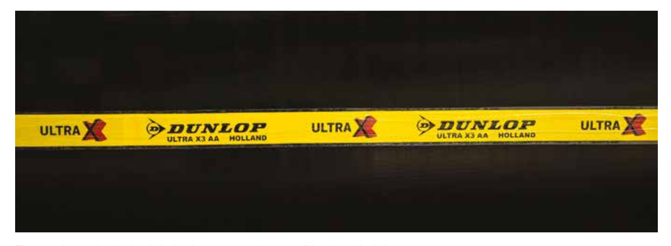
The way forward – single ply belts that are superior to traditional multi-ply in every respect.

and much of the machinery is often old and not as energy efficient as it might be.