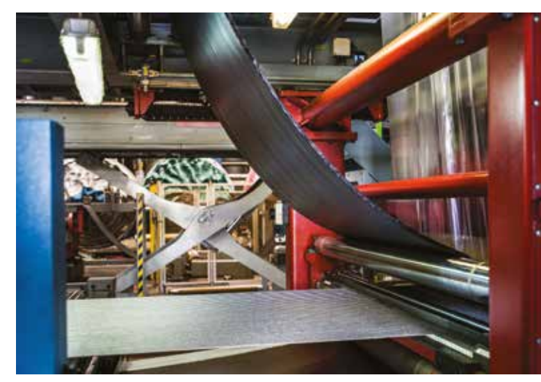
All Dunlop belts are manufactured in The Netherlands.

KdH: That is an interesting question because the answer is in two, inter-connected parts. The first part of the answer is that we have a market strategy of only selling premier quality belts that are exclusively manufactured in our own facilities. This means that we have total control over the quality and safety of the finished product and all of the raw materials that go into that finished product. This has been a principal of our business for over 100 years. The 'unique selling proposition' that we use is 'lowest lifetime cost'. Our belts are so superior to low-grade imported belt that they can quite easily last for up to four or five times longer, so although the Chinese belts can have a significantly lower retail price, our belts actually cost a lot less in real terms. The hard part is persuading customers to compare the cost rather than the price.