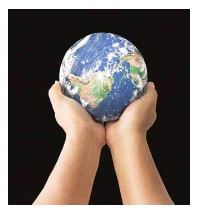
In our hands.

The most common type of belt has an inner carcass consisting of multiple layers of polyester and nylon fabric