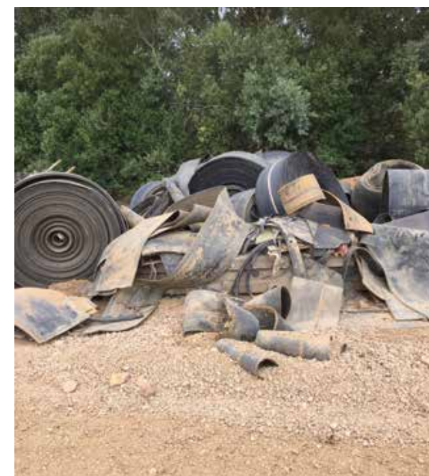
Out with the old – ruined and worn out imported multi-ply belting from the pre-Dunlop days.

"In our view, if a contractor is charging for carrying out repairs, supplying replacement components and charging