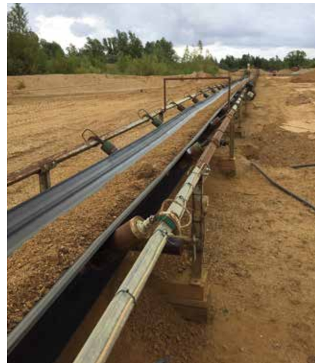
The field conveyors at Little Paxton are owned and maintained by MES International.

Very significantly, MES are paid a rate per ton, which therefore puts the pressure to maximise output fairly and squarely on their shoulders. "It is a good arrangement for both parties", explains MES owner and managing director