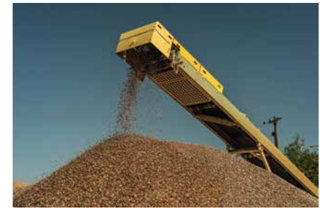
With Ultra X belts, output has increased significantly.

rubber compounds were already well-recognised as being the hardest wearing and longest lasting" explains Smilda. "What they came up with was actually beyond our wildest dreams because Ultra X possesses more than 3 times greater longitudinal rip resistance, up to 5 times better tear resistance and a far superior resistance to impact compared to traditional 3-ply or even 4-ply belting. At the same time, it also has incredible tensile strength. An Ultra X3 single ply belt is able to pull up to 56 tonnes in weight, which as you have seen at Little Paxton, means that it can even handle adverse weather conditions without losing productivity". "The teams at MES and Aggregate Industries in Little Paxton deserve a lot of credit for what has been achieved there".